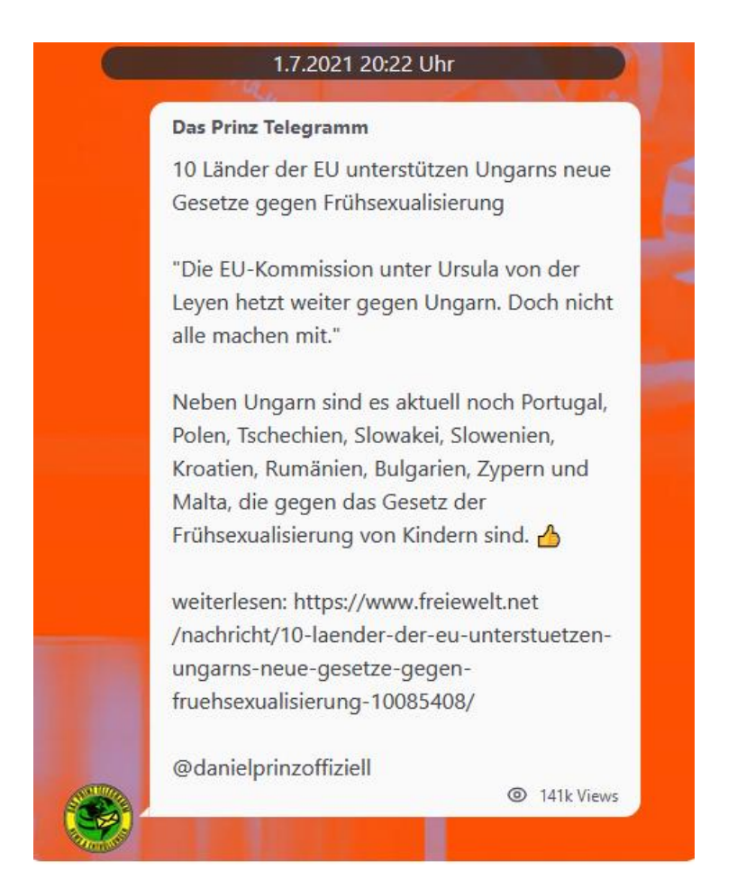
Figure 2: A very high-reach message on the topic of alleged "early sexualization." The post has been viewed over 141,000 times.<sup>5</sup>

Recent weeks and months have shown (in the US among other places) targeted mobilization efforts against the rights to bodily autonomy of women and LGBTIQ+. This tendency has also been permeating the right-wing extremist scene in Germany and has combined with existing resentments in certain parts of society. Attacks against queer people and queer gatherings are happening not just in the US, but also in the center of Europe.