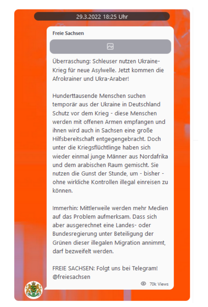
Figure 4: Post on refugees from the so-called "Freie Sachsen" (Free Saxons).<sup>10</sup>

This trend is also evident in Germany: according to the Federal Office for Migration and Refugees, a total of 81,784 people applied for asylum in Germany between January and May 2022. This represents an increase of 20.9 percent compared to the previous year.<sup>9</sup>