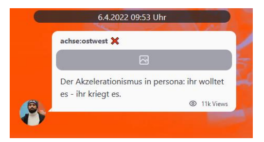
Figure 5: Comment on accelerationism from April 2022. The same account in April 2021 spoke of how "only accelerationism can save us now" and concluded, "so take every iceberg with you."

Accelerationism is a strategy adapted by right-wing extremists to accelerate the disintegration of society and thus the overthrow of the system.<sup>11</sup> One tactic that is being used strategically in this respect is terrorist attacks, which are on the increase, particularly in Western countries, as has unfortunately been seen in various locations in the US as well as in Oslo. Attacks on infrastructure are also part of the accelerationist repertoire.