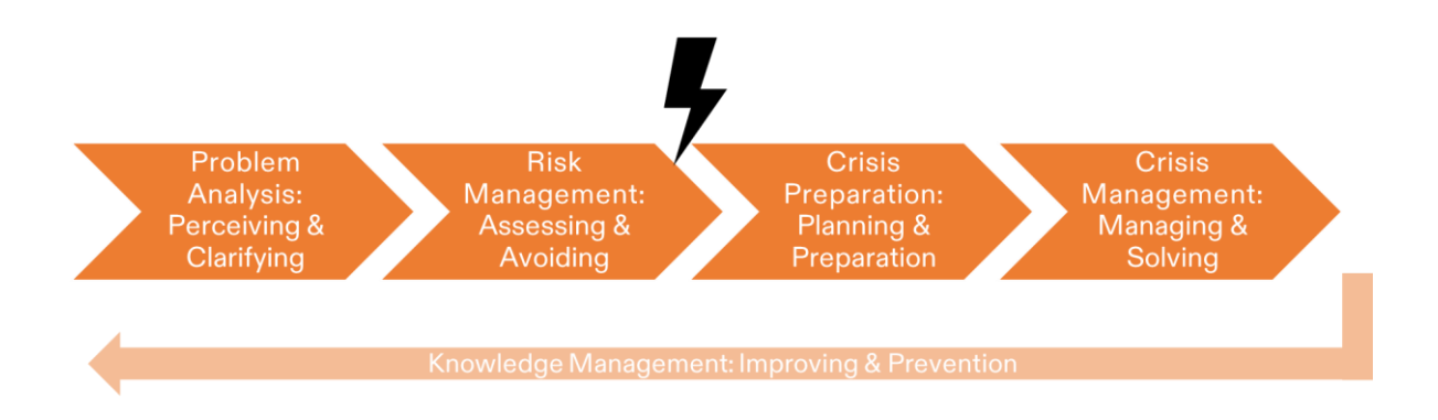
Figure 7: Strategic crisis management (adapted from Töpfer (2014))

The knowledge gained from the field of crisis management can therefore also be adapted – at least in part – for dealing with current threats. Right-wing extremist threats require ongoing confrontation. At the same time, acute crisis situations continue to pop up, as has been clearly demonstrated over the last two years.