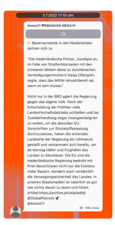
Figure 3: Widely-viewed reaction to the farmer protests in the Netherlands shared in a QAnon Channel. The post has been viewed over 138,000 times.<sup>7</sup>

Right-wing extremists have already tried in the past to present themselves in the industry as a voice of the people. One example of these attempts to exert influence is the right-wing trade union "Zentrum" (formerly "Zentrum Automobil").<sup>8</sup> Especially if even greater cutbacks become necessary, endangering people's economic well-being and employment, this could present another gateway for mobilization by right-wing extremists.