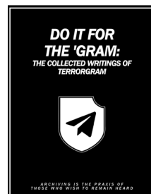
The cover of the Terrorgram publication Do It For The 'Gram

The renewed interest in the scene since the summer of 2021 is evident in the Terrorgram community's publications, some of which have been elaborately produced and published under the name Terrorgram Publication . Since June 2021, there have been publications twice a year from anonymous authors promoting militant accelerationism and calling for terrorist attacks (and in some cases including specific instructions on how to do so). Each page of these publications is designed in the aesthetic style of the scene. A notable exception is Do It For The 'Gram (a play on the internet phrase "do it for the [Insta]gram", but referring instead to Terrorgram). Unlike in previous publications, the authors do not use the NATO alphabet for their pseudonyms, but rather 28 Telegram channels from the scene claimed their own chapters. Only six of these channels are currently accessible on Telegram. This publication also has no elaborate graphic design, but only text on a black background. Although as many as 100 people are claimed to have collaborated on these publications in some cases, most of the chapters are written only by two to four pseudonyms. These publications provide motivation and instructions for future attacks, increasing the danger of accelerationist terrorist attacks in the future.